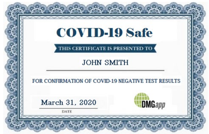
"Safe to Work" Certificate