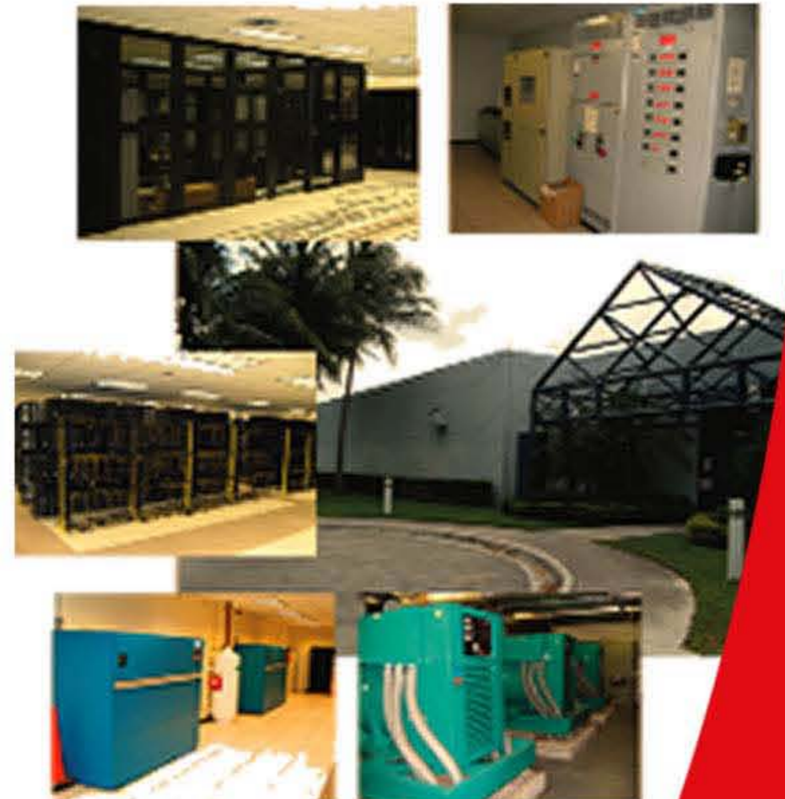
1Vault Data Center

The facility also has a state of the art FM200 Chemical fire suppression system, N+1 power feeds, disaster recovery dormitory and 3.75 Megawatt generators with on-site fuel storage to power the entire center.