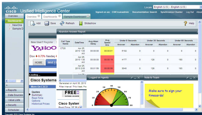
Figure 1. Cisco Unified Intelligence Center Dashboard

Built on a robust and extensible Web 2.0 framework, Cisco Unified Intelligence Center allows customers to extend the boundaries of traditional contact center reporting to an information portal where data can be easily integrated and shared throughout the organization.